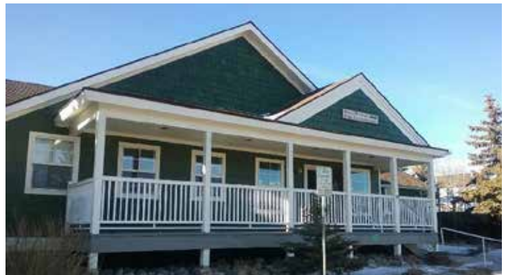
South Park Health Center